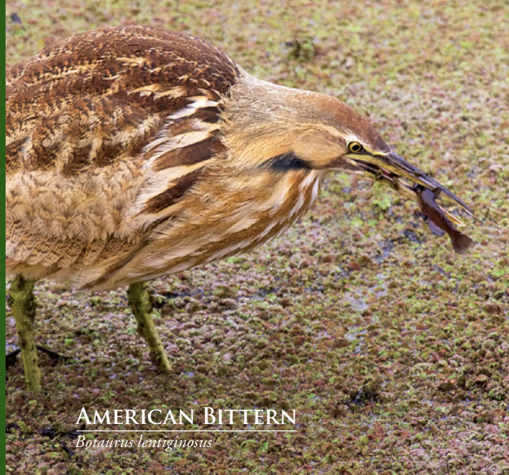
AMERICAN BITTERN Botaurus lentiginosus